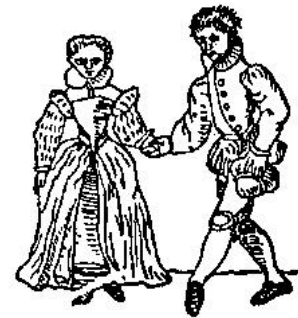
The Courtier, as seen by Sir John Davies.

W hat a family is without a steward, a ship without a pilot, a flock without a shepherd, a body without a head, the same, I think, is a kingdom without the health and safety of a good monarch. Princess Elizabeth to her brother King Edward.